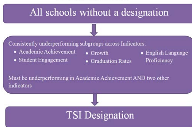
TSI Designation Flow Chart

During their designation year, the school must work with stakeholders (principals, other school leaders, teachers, and parents) to create a TSI plan or SPP to improve student performance. They then have three years to implement this plan. Schools designated as TSI may be eligible to receive federal funds to help implement the improvement plan. At the end of this period, the school is evaluated for exit.